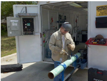
Mobile OQ Trailer for Field PV's

We will travel to you, anywhere, 7 days a week. We pride ourselves on Quality, Reliability, and Availability.