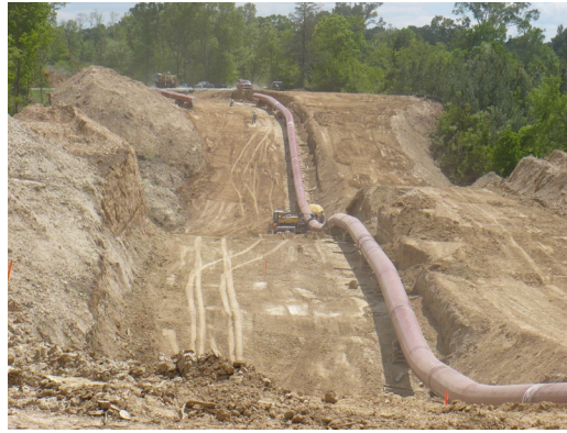
On-site safety personnel