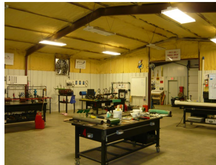
Shop for OQ Performance Verifications