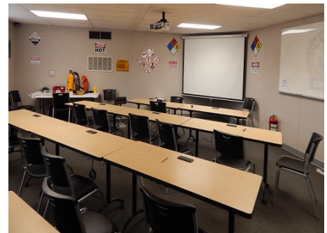
One of our classrooms