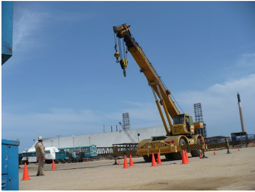
Crane Operator Certification